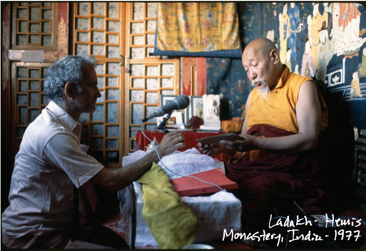
Ladakh - Hemis Monastery, India - 1977