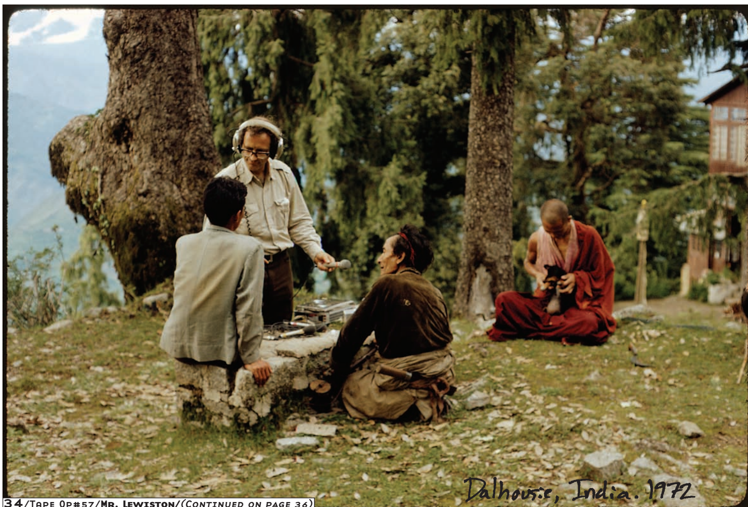
Dalhousie, India. 1972