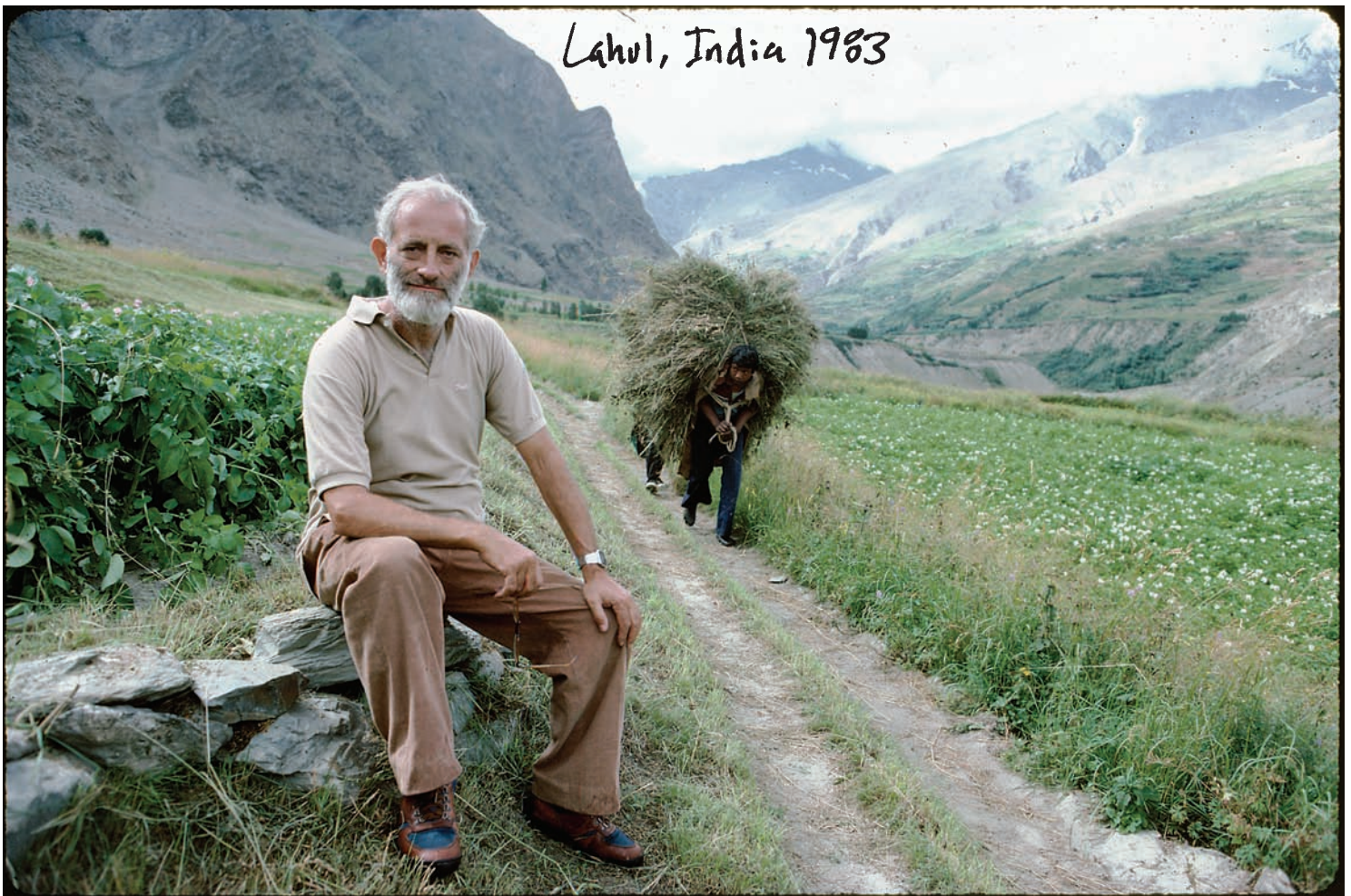
Lahul, India 1983