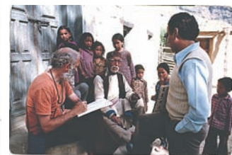
Lahul Tandi, India. 1981