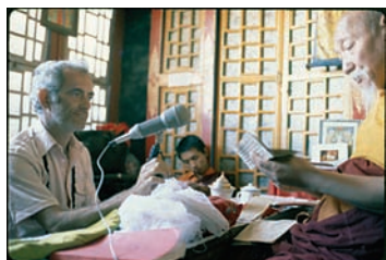
Right: Ladakh- Hemis Monastery, India. 1977.