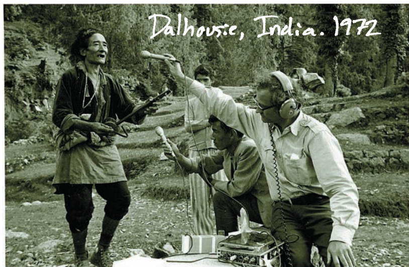
Dalhousie, India. 1972