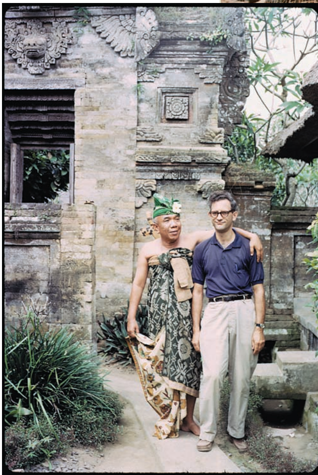
Above: Ubud, Bali. 1966