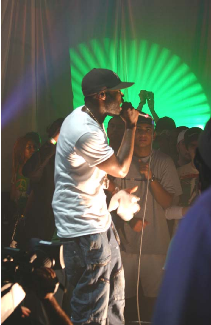
Roots frontman Blackthought rocks the mic: an RE510

the course of the evening. N/D 868 kick drum mics also added some serious punchy low-end to The Roots trademark fusion of Hip Hop sensibility and live rock instrumentation – a perfect pairing with EV's awesome X LC and X-Line subwoofers. Sound reinforcement equipment was provided by Sound Associates, Inc., with support from Logic Systems.