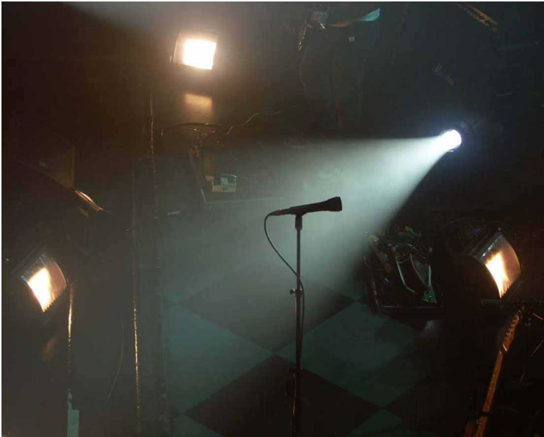
The unmistakable profile of the N/D967 in the spotlight

this sense we're interested in putting together a system design that can translate the musical ideas on a Roots recording into a live performance, comprised of equipment that will be available in any location around the world. Working with Telex Communications brands will allow that level of global availability, adding consistency to our concept of a 'Roots sound system'. We've had live sound issues in the past as we use 'rock' instruments, but don't necessarily want a regular rock mix – this is a band, but this is also Rap, it's Hip Hop. At Webster Hall we wanted to approximate the feeling and atmosphere of someone listening to a Roots CD at home on a surround system in a loud, live situation. Working with a company like Telex Communications will help us realize these concepts in a live situation by offering total system solution advice, design and support, from a mic'd input signal to a loudspeaker's output energy, with everything covered in between. Becoming EV® microphone endorsers is the obvious place to start this kind of relationship – since we'll be touring in support of the new album for pretty much the rest of the year, these mics will be seriously put to work.”