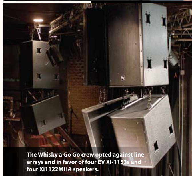
The Whisky a Go Go crew opted against line arrays and in favor of four EV Xi-1153s and four Xi1122MHA speakers.