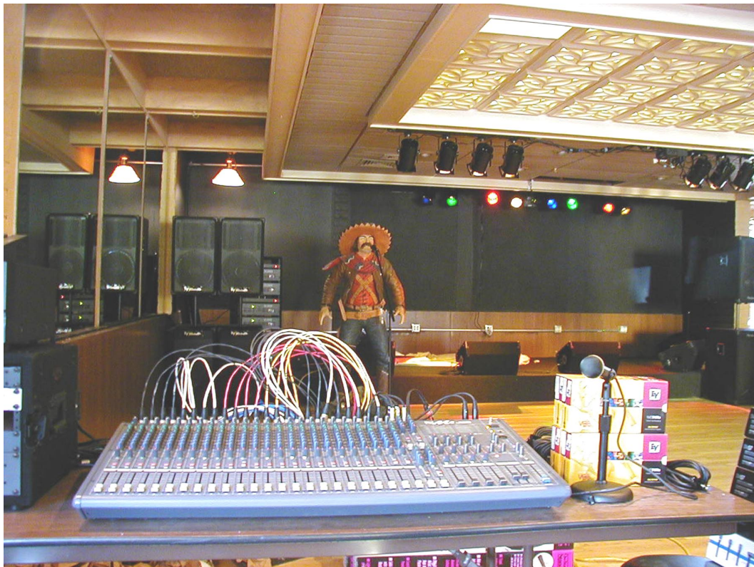
M4/24 at FOH, with brand-new N/D767a mics on hand