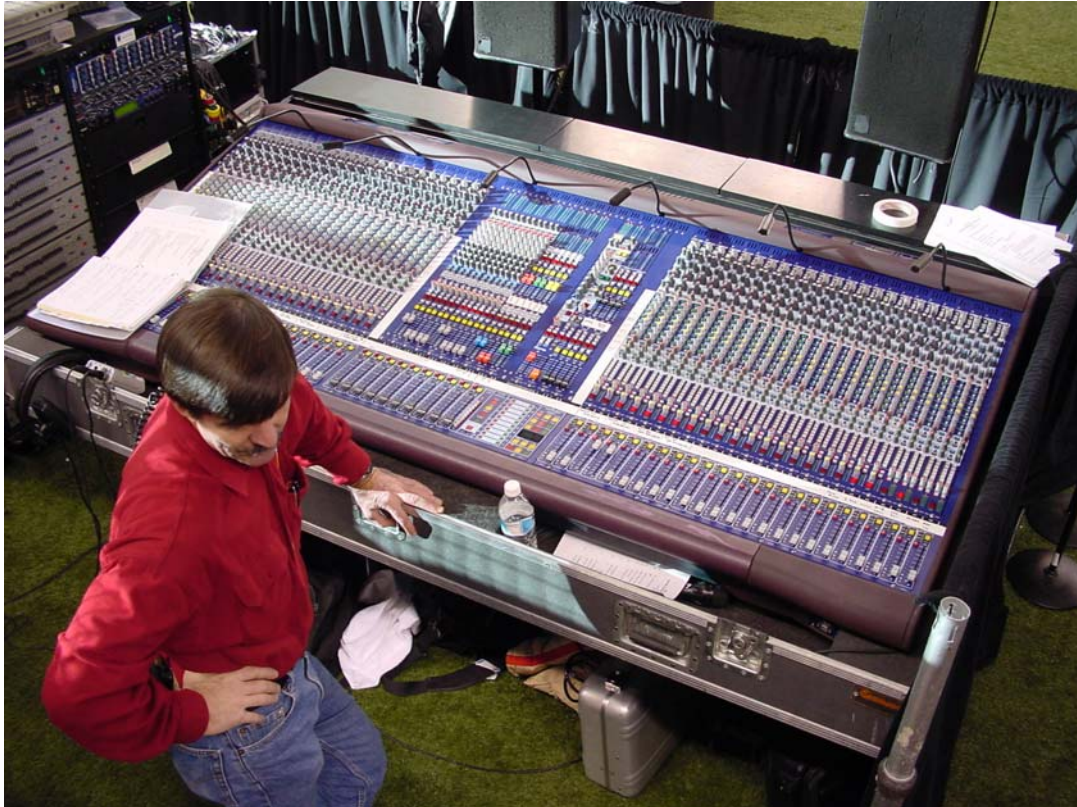
Midas Heritage 2000 at FOH

sound coverage and setup options. The Heritage 2000 is ideal in this situation: it's a console designed specifically for FOH duties, and is therefore ideal for outside broadcast applications like this, having no superfluous monitoring controls. Midas designs a wide range of consoles for various applications and at various price points, all with an uncompromising level of quality. This means high-end preamps and EQ's can be utilized in specific applications without the unnecessary expense, weight or size of a larger board. I think this whole rig represents that kind of attention to detail."