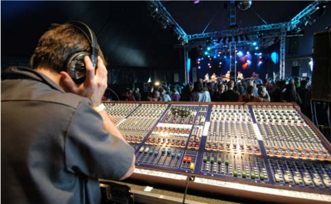
Midas Verona at FOH

The premiere of the Sonnenrot Festival (16/17 July) in Geretsried near Munich was an opportunity to take stock of Germany's pool of young rock talent. A large Cobra-4 system delivered the requisite power.