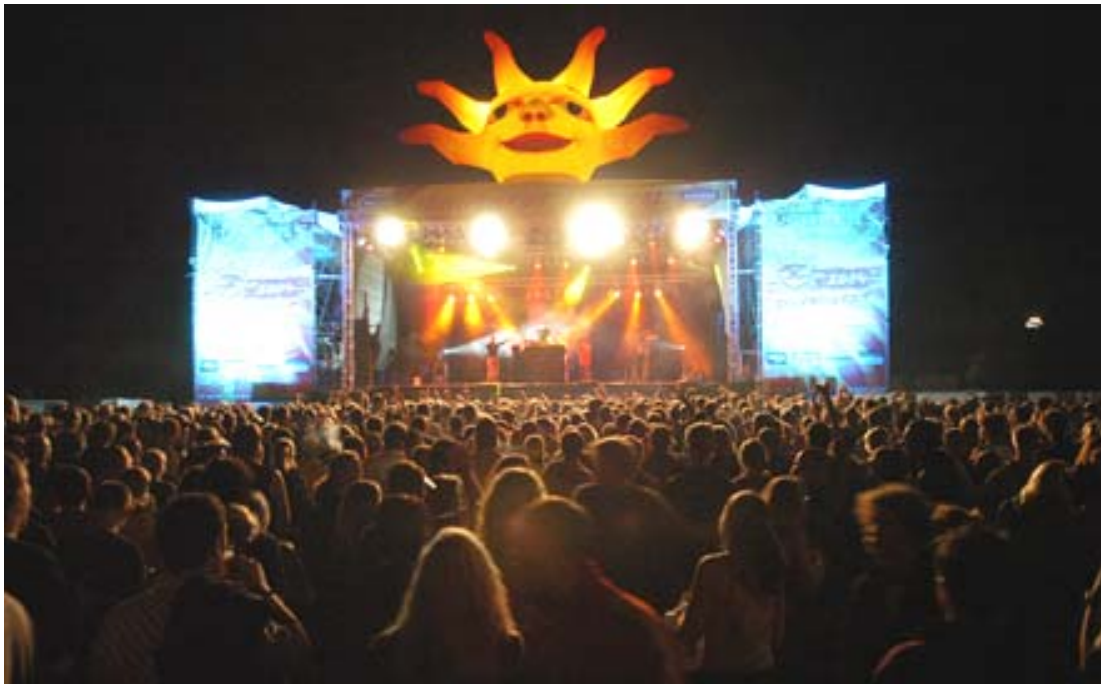
Club ambience inside the marquee — with the Dynacord Cobra & Madras (monitor) and Midas Verona