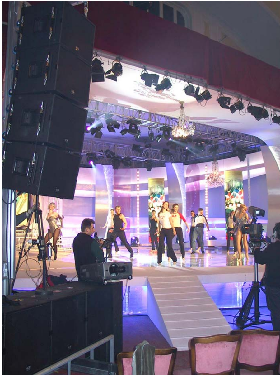
The Radio and TV Festival in Opatija was one of the media events of the year in Croatia. The tone was set by Mr. Pink, the Dynacord Cobra & Co.

Pro Audio Group EV • Telex • Midas • Klark Teknik Dynacord • RTS • University Sound