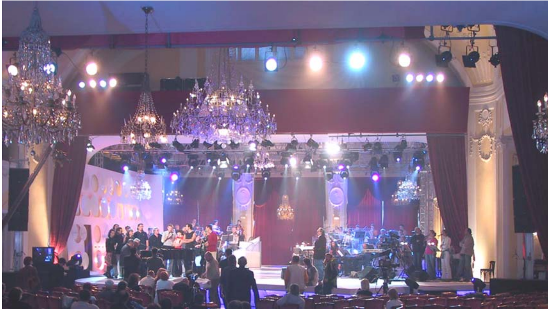
Fashionable, but tricky from a sound reinforcement standpoint: the "Christal Hall" at the Kvarner Hotel in Opatija, Croatia.

Two festivals held at different corners of the Earth had two things in common: first-class sound and the Dynacord® Cobra™ System.